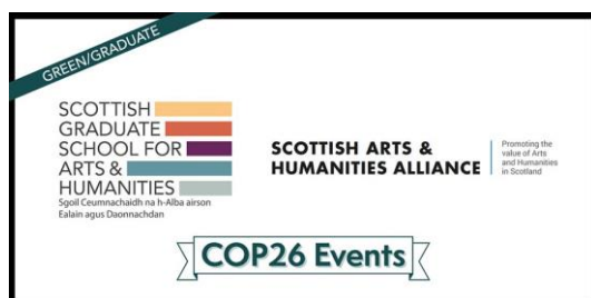
Figure 1 COP26 Lecture Cover Page

In response to the COP26 event which took place in October-November 2021 in Glasgow, SAHA prepared and delivered a keynote lecture in collaboration with SGSAH.